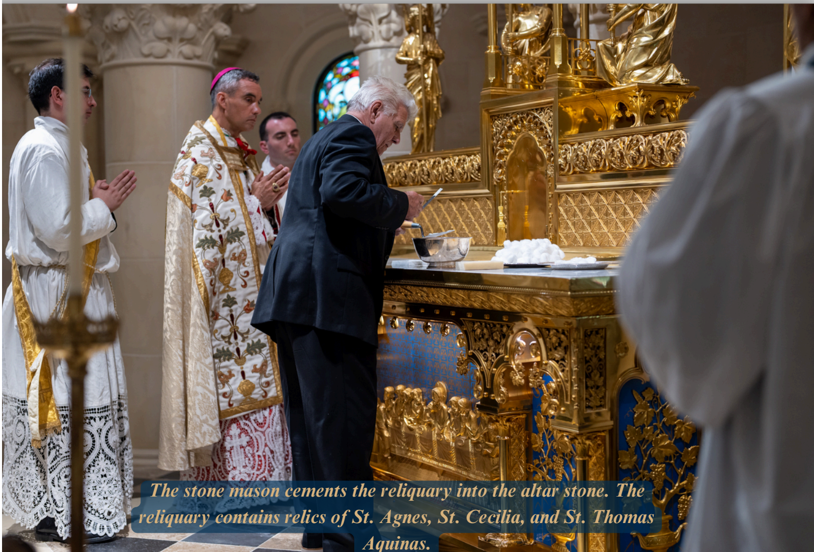
The stone mason cements the reliquary into the altar stone. The reliquary contains relics of St. Agnes, St. Cecilia, and St. Thomas Aquinas.