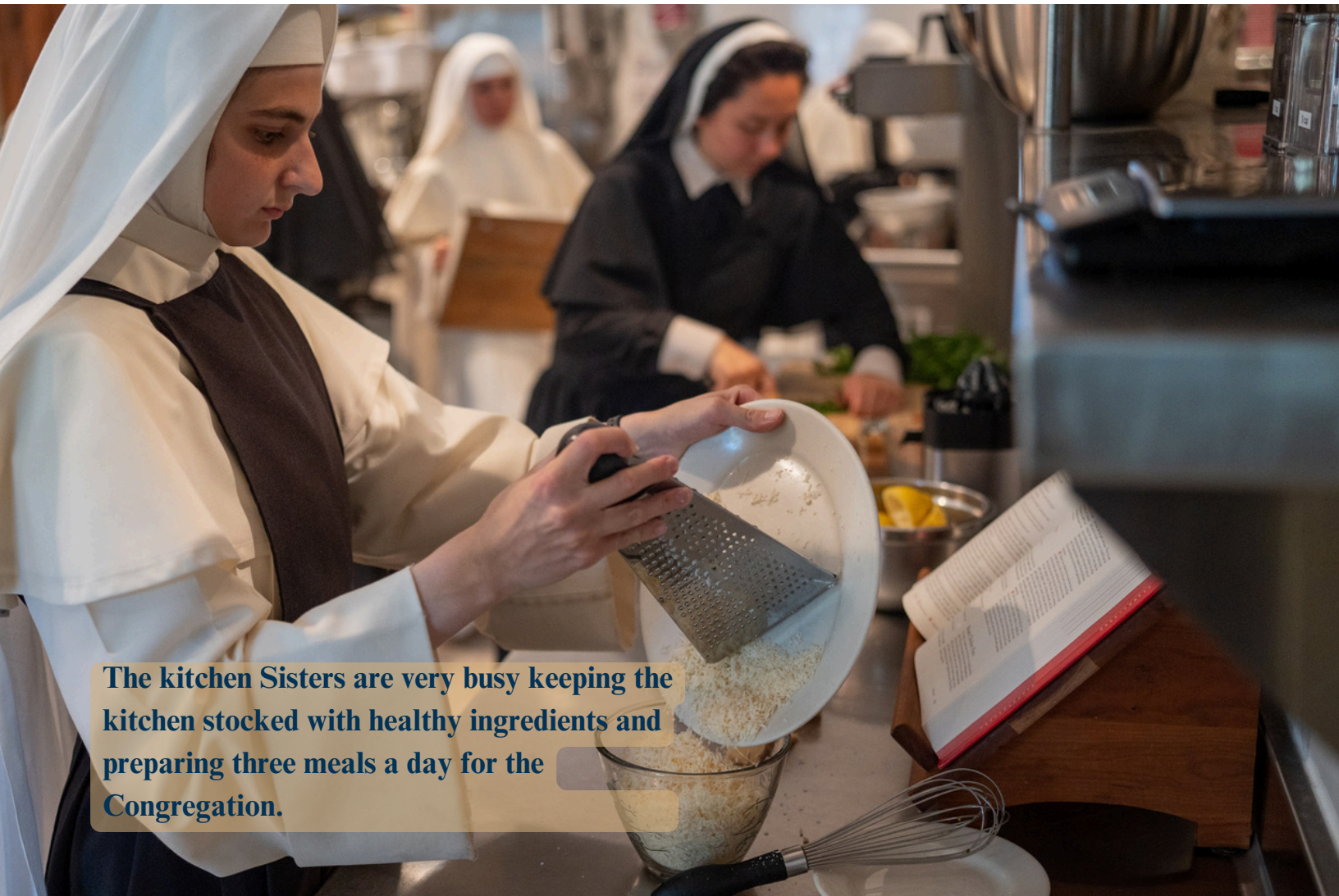
The kitchen Sisters are very busy keeping the kitchen stocked with healthy ingredients and preparing three meals a day for the Congregation.