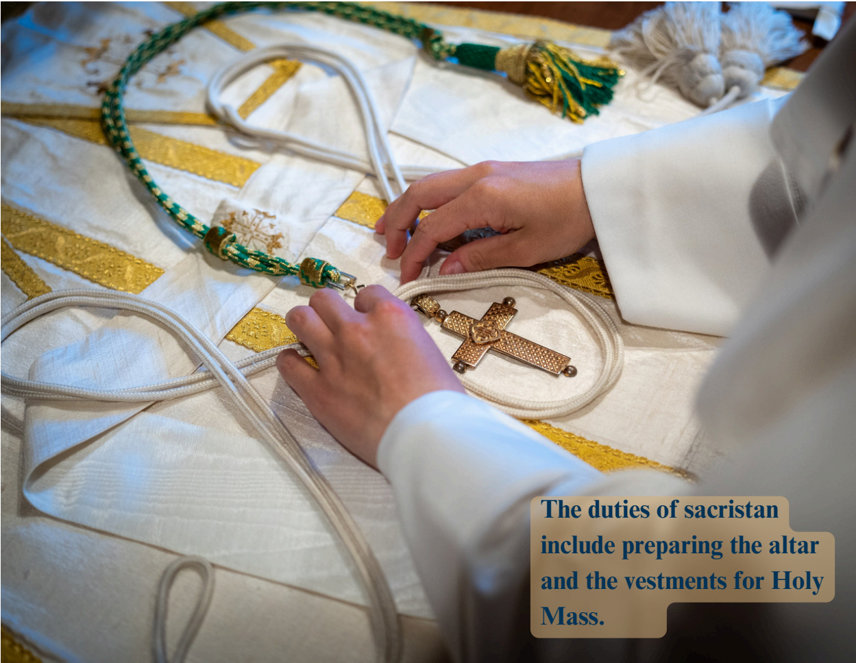
The duties of sacristan include preparing the altar and the vestments for Holy Mass.