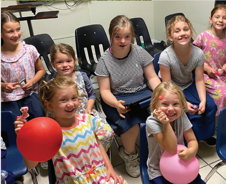
Mardi Gras was a welcome day of games and fun for the students.